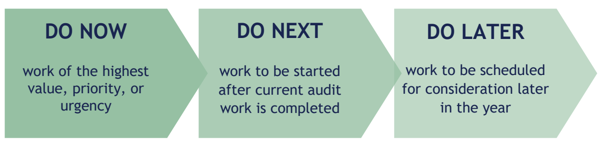
Figure 2: 'do now', 'do next', 'do later' prioritisation system.

17 Decisions on which category of the three categories internal audit work falls into will be based on judgement and will be made having given consideration to the prioritisation factors in table 1 below. These will result in internal audit work being considered a relatively higher or lower priority at the time of assessment.